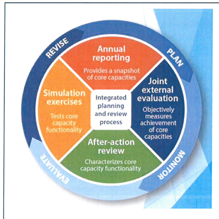
Figure 1: Joint External Evaluation (JEE) Key Recommendation