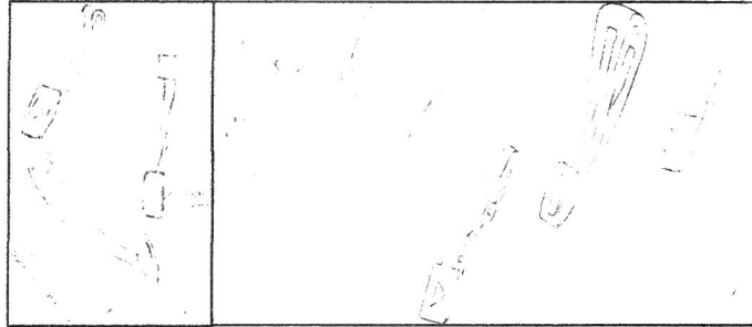
Fig. 3(a) Showing Concept 1 generation sketches (Left) (b) Showing Concept 2,3,4 and 5 generation sketches (Right)

Then, 3D model based on the selected two best sketches based in the previous process are generated using SOLIDWORKS. The 3D model is a more refined version of the accelerator pedal concepts, and this is needed in the final evaluation using stress and displacement analysis to complete the requirements of the PDS. The material of the model was also assigned to the model with its specific properties so that the simulation results is more accurate. Two of the conceptual designs 3D model underwent 2 simulations in Solidworks. The simulation used is based on the static simulation. The model is treated as one solid body to reduce the complexity of the analysis as it is a static simulation. The displacements must not be more than 10mm [6].