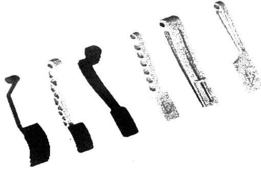
Fig. 4 (From Right to Left) Existing Design, Concept 1 Concept 2, Concept 3, Concept 4, Concept 5.

position for both designs also is in the optimized position based on the calculation from the NIOSH database [4] thus presenting better comfort angles for Malaysian drivers.